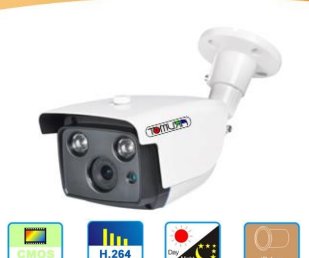
Multi-function, more intelligent monitoring